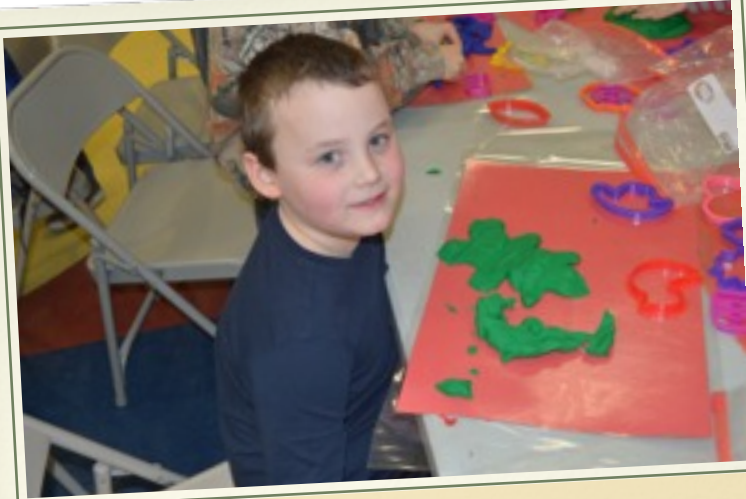
PBIS Main Event